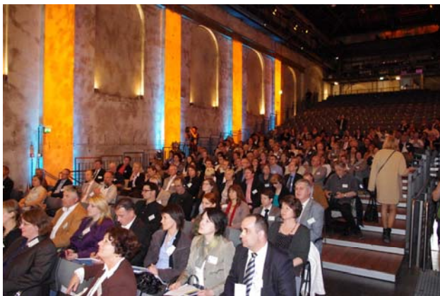
Audience at the conference