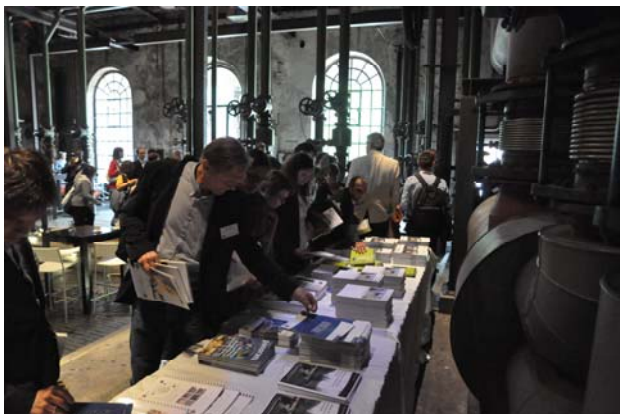
RegGov dissemination of outputs