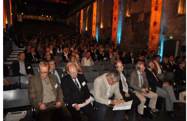
Audience at the conference

The URBACT Fast Track Network “RegGov – Regional Governance of Sustainable Integrated Development of Deprived Urban Areas” has presented its exchange and learning activities.