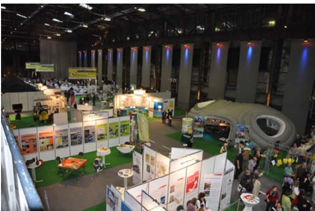
Event: Exhibition of neighbourhoods

The RegGov Partner Cities have been facing a broad range of challenges regarding their respective disadvantaged neighbourhoods. Integrated urban regeneration is one of the fields in which manifold challenges need to be tackled. Horizontal and vertical cooperation are necessarily linked. On the one hand, focusing only on horizontal relationships within the cities and neighbourhoods would ignore the importance of the regional, national and supra-national framework as a black box, although crucial pol-