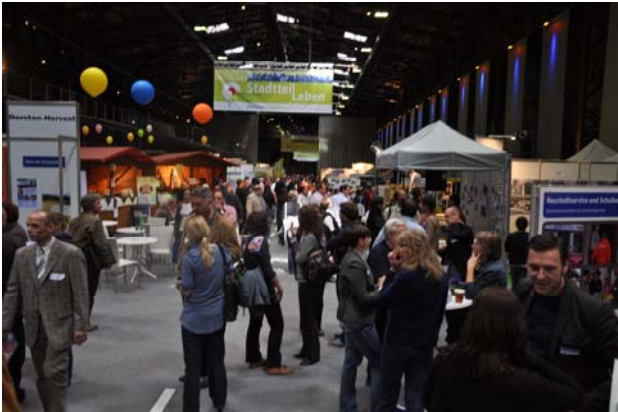
Event: Main street

The Partner Cities of the RegGov network were actively involved and represented at the event “StadtteilLeben – Active Cities in NRW and Europe” featuring their cities and projects and sharing their experiences with over 1,200 participants, together with representatives of DG Regio and the URBACT Secretariat.