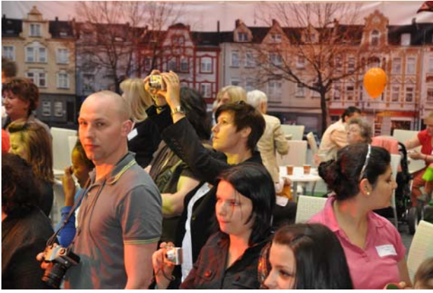
Event: Main square

The Partner Cities of the RegGov network were actively involved and represented at the event “StadtteilLeben – Active Cities in NRW and Europe” featuring their cities and projects and sharing their experiences with over 1,200 participants, together with representatives of DG Regio and the URBACT Secretariat.