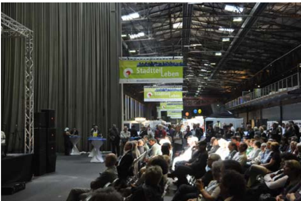
Event: Audience in front of main stage