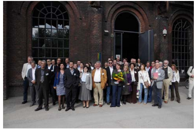
The RegGov network

In the latest RegGov Newsletter (no. 8, June 2011) please see more pictures from this event and learn more on the outputs!