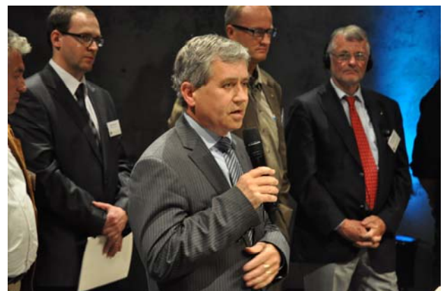
Iuliu Ilyes, Mayor of Satu Mare (RO)