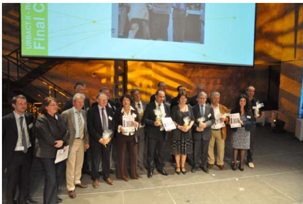
Local Action Plan Launch Event