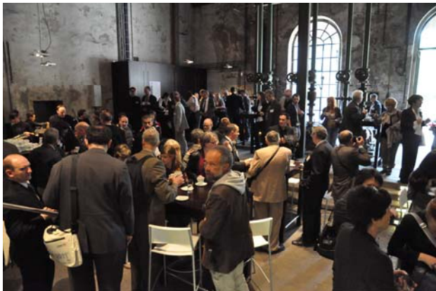
Exchange at the conference

The RegGov Network aimed to make these practical experiences accessible to all partners and help them develop and implement new integrated strategies for a sustainable development at neighbourhood level.