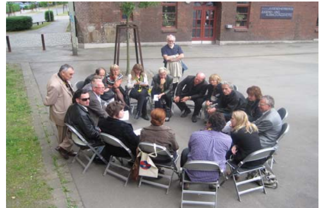
Event: Workshop on Roma integration