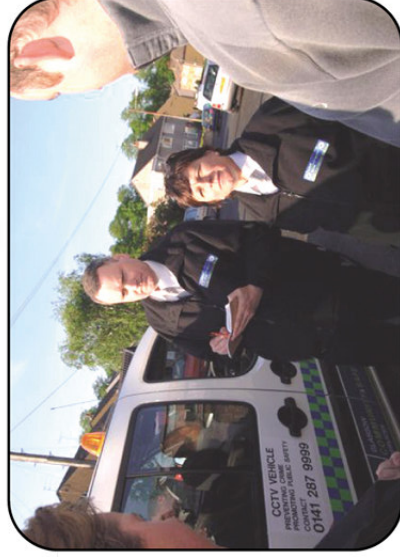
Community Safety Patrol Officers