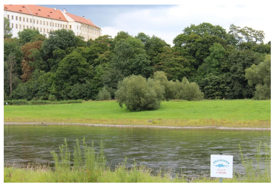
Barbecue places in Děčín

information about each route is on information panels installed in the forest park, but also at some other places in the City. This physical activity is intended for almost all age and performance brackets.