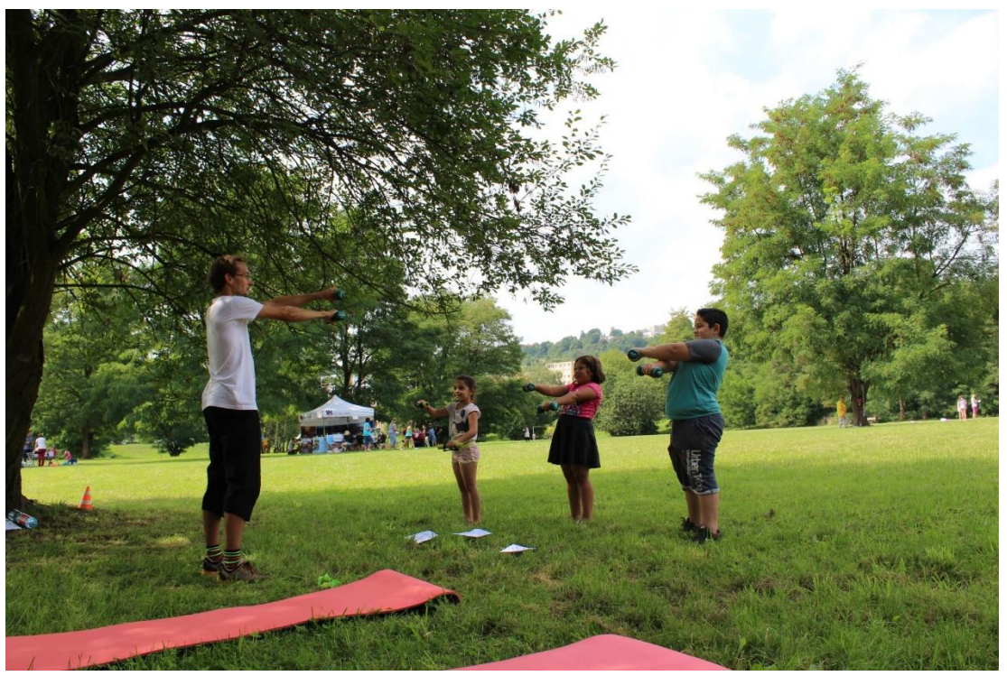
Neighbour's Afternoon Party in Krásné Březno

The Urbact Local Group members were/are: