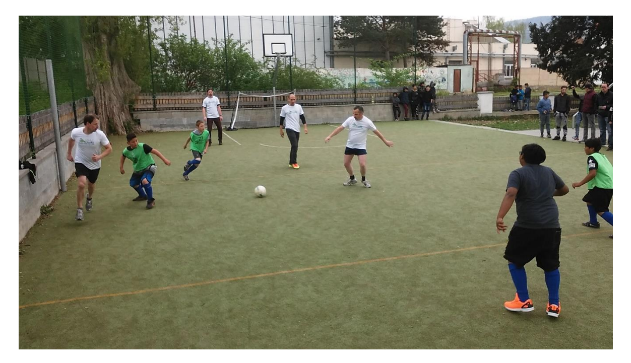
Football tournament "Football for Development" held in April during the Deep Dive Meeting in UNL