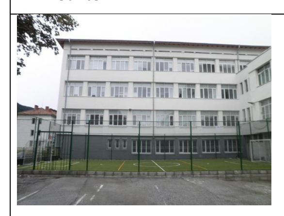
High School "Sv. Sv. Kiril I Metodi"

These buildings are in close proximity to the pedestrian area of the so called old city centre where the citizens of Smolyan go for shopping and dining. There are also a number of public buildings like the District Police, post office, many banks and offices. The problem with the parking in the area has escalated in the past years. Due to its public function the place is highly visited by the citizens and also the guests of Smolyan. New organization of the parking system is planned as well as instalment of smart parking meters.