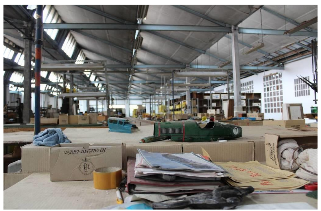
Ibi, creative spirit

Boosting Creative Entrepreneurship through creative-based Urban Strategies