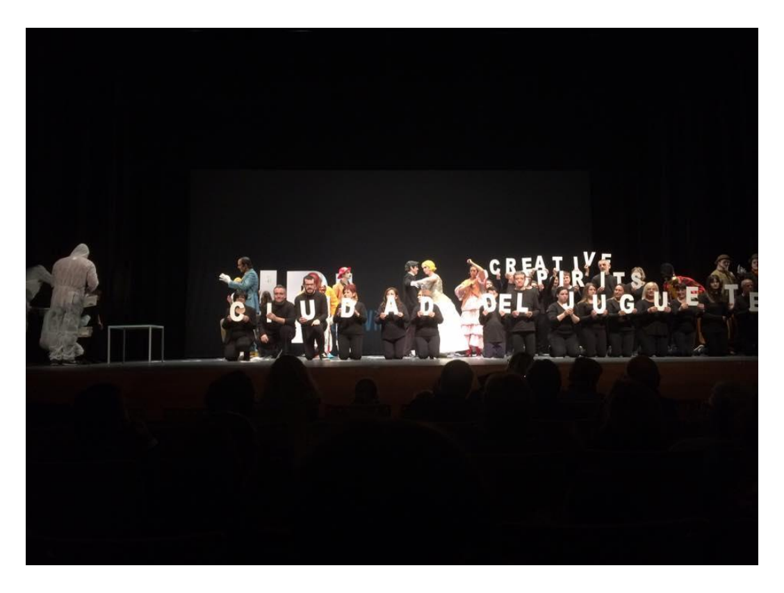
5.6 Implementing Community Engagement Actions:

The different departments of the City Council joined together to organize different activities, such as, for example, making available emblematic spaces such as the Rio Theater or the Biodiversity Museum. Proof of the involvement of citizens was the event organized in the Rio Theater that was used to raise awareness of the project among the public and had its great culmination in a play organized collaboratively between different associations in the city .