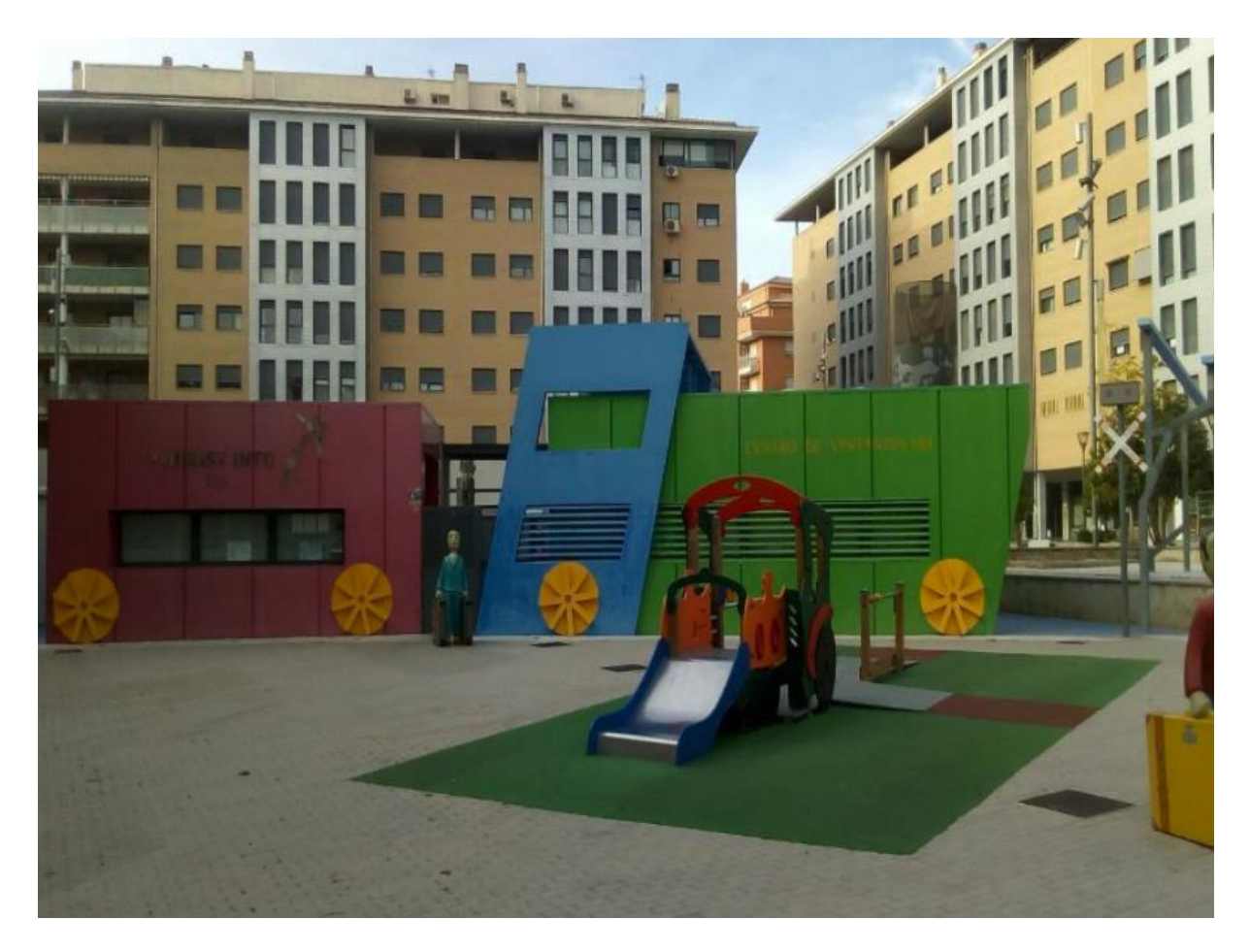
The cultural-creative industry in the local economy

As already mentioned, Ibi had and still has a significant toy industry. The city is also active in research and development related to toy-manufacturing: the Technological Research Institute of Toys and Children Leisure, which is a centre of creativity is located in Ibi.