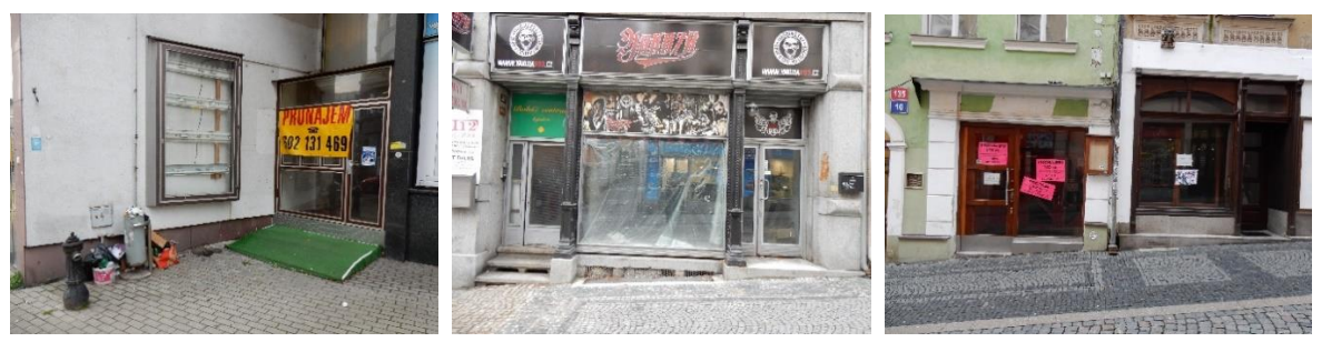
Fig. no. 3 Selected empty and unused premises in the city centre

Even though Liberec has comparatively high purchasing power, there is an absence of big brands in the city. Customers commute 100km to the Czech capital of Prague for shopping in the big brands stores. Initially, big brands had opened outlets in the shopping centres when they were built: however, they closed their branches after some time. They were replaced by a new type of retail: stores selling lower quality goods, second hand stores, shops of electronics and especially empty and unused stores. In November 2017 the share of empty retail premises was 7,55%.