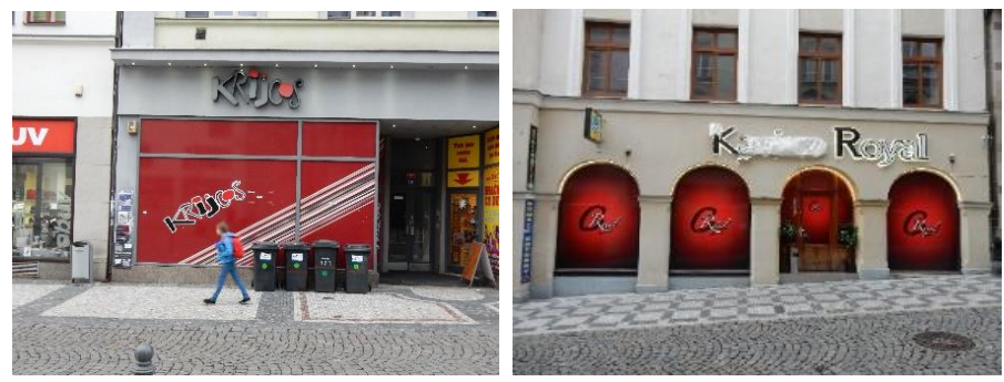
Fig. no. 4 Casinos and gaming rooms in the Liberec city centre

In 2017, the Liberec Technical University undertook a problem analysis of retail in the city centre. One of the monitored indicators is the city centre's vitality and viability index according to PPG6<sup>1</sup>, which in 2017 corresponded to 2,91 (in a scale 1 to 5 being 1= very bad and 5= very good). This result corresponds with the description: average function of the city centre or even insufficient modern conditions. The city centre demonstrates, in particular, issues with quality.