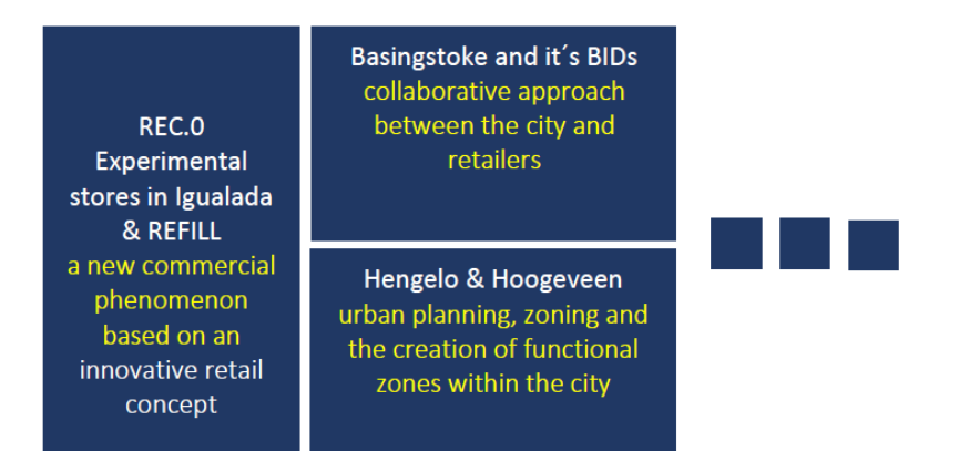
Fig. no. 6: Inspiring ideas for IAP RetaiLink Liberec

provided space and time for a thorough analysis of the issue, the integration of all suggestions and aspects affecting retail, and to seek integrated solutions within the strategic planning of the city.