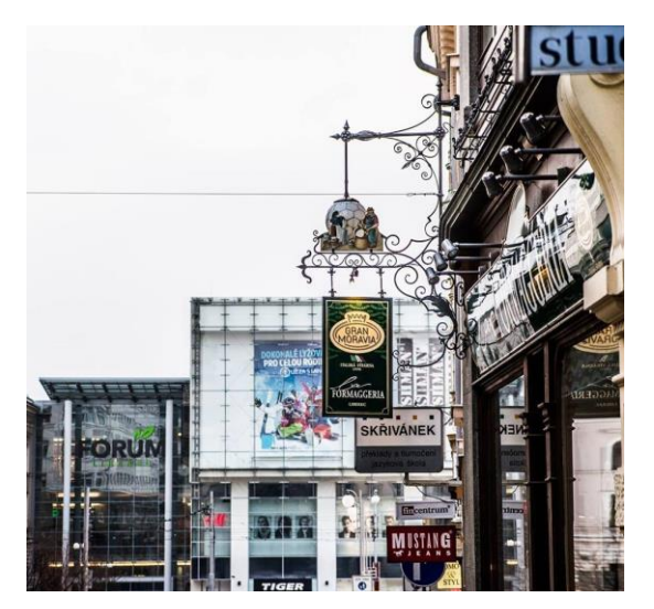
Retail in Liberec

The Liberec City Council interacts and communicates with other institutions, entrepreneurs and residents to seek a solution to the current and future challenges for the city centre development and prosperity.