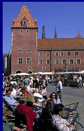
Kick-off – HerO – 30 June 2008 – 1 July 2008 Regensburg