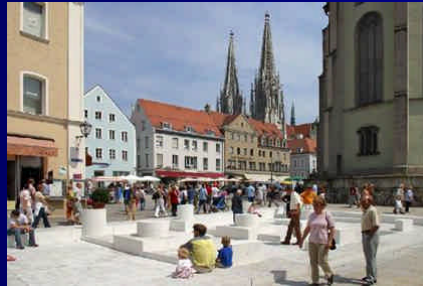
Kick-off – HerO – 30 June 2008 – 1 July 2008 Regensburg