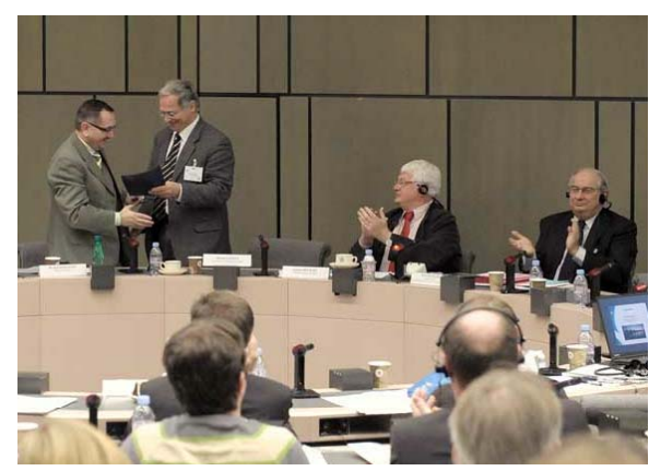
Signature during the conference of a cooperation agreement between the border towns of Slubice (Poland) and Frankfurt (Oder) (Germany).

Roland Ries, who made the Eurodistrict "Strasbourg-Ortenau" a main objective of his programme, expressed his will "to move from cooperation to codecision". He also stressed the necessity of a better involvement of the citizens in order to demonstrate that "the construction of Europe is not an independent process undertaken by specialists". This citizen involvement is one of the principal issues of the Eurodistrict project.