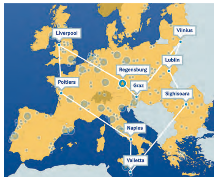
HerO project meeting in Naples, November 2010

To capitalize on the experiences of other historic towns in Europe and to widely disseminate the network's results, the HerO network cooperates closely with the 'European Association of Historic Towns and Regions EAHTR', an organization formed by the Council of Europe in 1999 that represents almost one thousand historic towns in Europe. Further information at www.historic-towns.org .