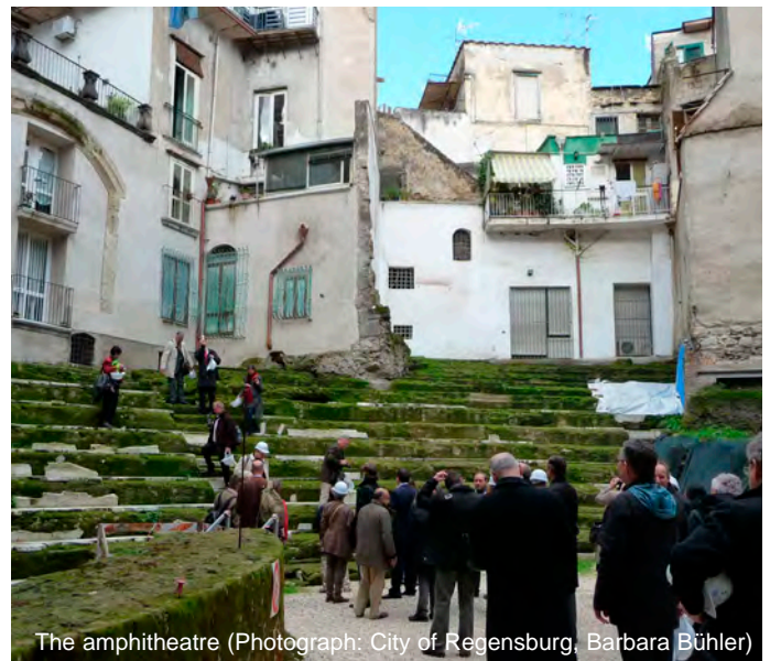
The amphitheatre

A mix of different functions is essential for a sustainable and future-proof development of old town areas. Hence, to keep historic urban landscapes vital and attractive places, the demands of inhabitants, visitors and retail trade need to be reconciled with the preservation of the (tangible and intangible) cultural heritage assets. Keynote speaker Jean-Pierre Charbonneau from Paris introduced the topic and raised relevant issues before the project partners exchanged about the challenges and approaches in their cities in regards to traffic and infrastructure, noise pollution, retail initiatives and the careful renovation and re-use of buildings.