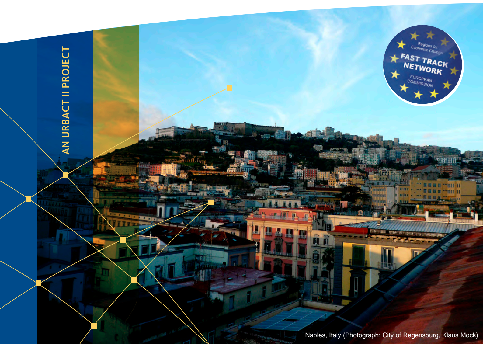
Naples, Italy

+++ Save the date: The HerO Final Conference will take place in the Lead Partner City Regensburg on 13th-14th April 2010. Further information will be available soon +++