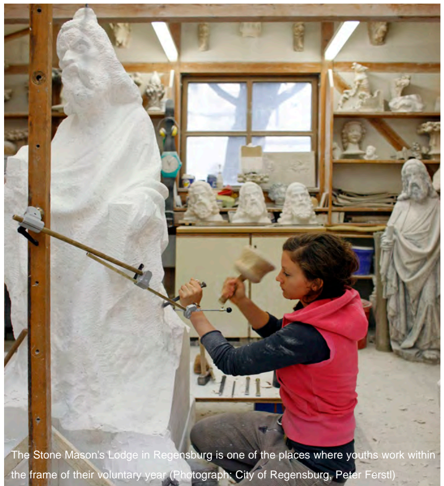
The Stone Mason's Lodge in Regensburg is one of the places where youths work within the frame of their voluntary year

The voluntary year starts on 1st September each year. The practical work will be accompanied by 35 days of seminars where the young people learn about ancient handicraftsman techniques (like blacksmith, stucco and clay sculpturing), con-