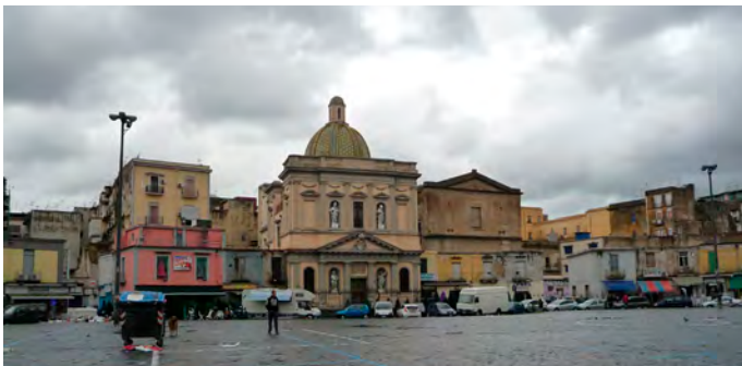
The Piazza Mercato

The colleagues from the City of Naples presented their projects on the ground: Walking tours through Naples' city centre gave participants the opportunity to learn about the local characteristics and challenges and to explore the city's rich cultural heritage. Further, the HerO project partners got the chance to meet local stakeholders and learned - amongst others - about a project on traditional handicraft, about the excavations of an ancient amphitheatre which is partly hidden by recent residential buildings, about an art project in Naples' metro stations and about the planned upgrade of Piazza Mercato - a project carried out in cooperation with the university.