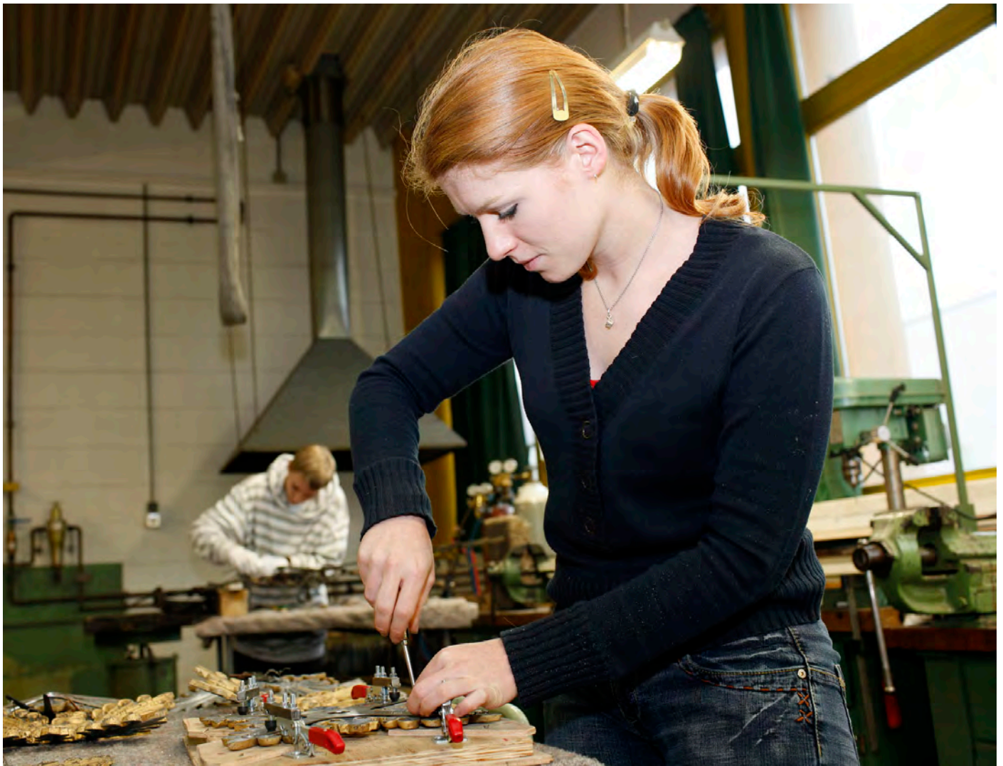
Youths at work

http://www.ijgd.de/In-der-Denkmalpflege-FJD.106.0.html (here you can download the flyer on the voluntary year in monument preservation in German, English, French, Polish, Czech and Russian language)