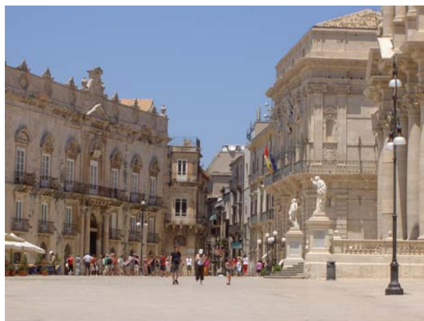
Siracusa, Ortigia, Piazza Duomo with the city hall (right)

That was confirmed by the lectures later that day. The city-wide monitoring systems in Duisburg and Nijmegen are strongly developed: