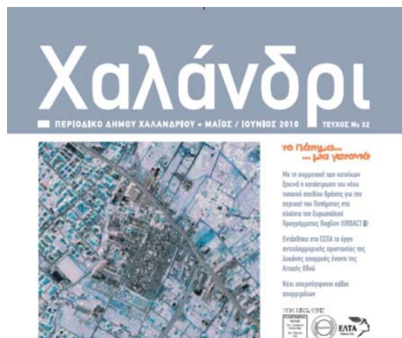
The cover of the 'Halandri' issue dedicated to the RegGov project.