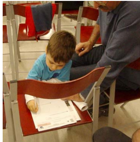
Everyone was urged to contribute by filling in the questionnaire.