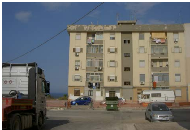
Field trip through deprived neighbourhoods in Siracusa

In the afternoon, we saw a good example of that during the field trip through some neighbourhoods of Siracusa, especially the deprived areas with many, quite poor apartment buildings and high unemployment. This was a big contrast with the touristic setting of Ortigia, the renovated harbour area in which we had our meetings (city hall) and hotel.