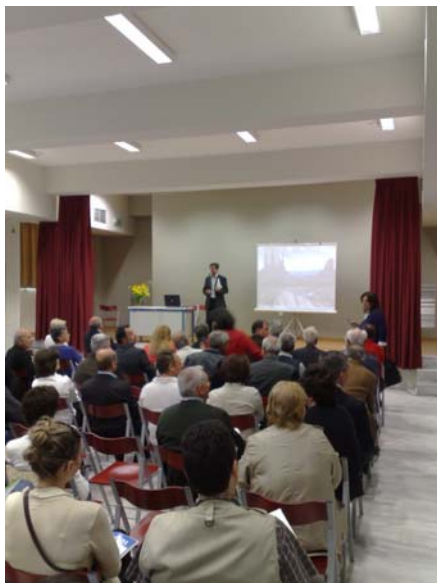
Open debate – an inhabitant of the area presenting his view on the LAP.

This was the first of a series of open discussions that were initiated and supported by the Municipality asking actually inhabitants to take actively part in local governance.