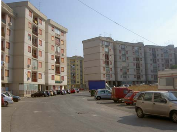
Field trip through deprived neighbourhoods in Siracusa

During the second day we further discussed the experiences in our cities referring to the collection of data and the use of monitoring instruments. And above all we tried to determine what lessons to be learnt for cities that are still at a (relative) start of real data collection and monitoring.