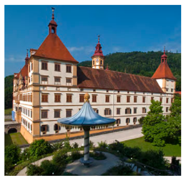
Schloss Eggenberg in Graz

Graz, Austria