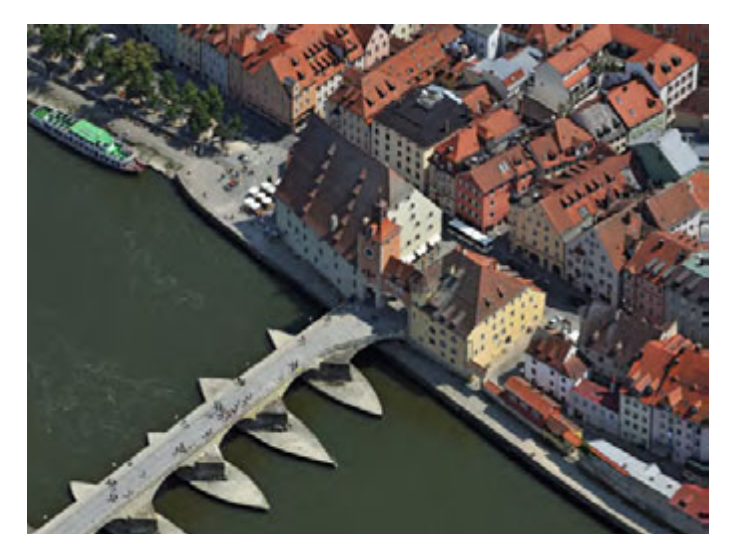
The historic saltbarn and the famous stone bridge in Regensburg

On 13th and 14th April 2011 the HerO network's results will be presented to the public at its final conference in Regensburg. Conference venue will be Regensburg's historic saltbarn which is located at the river Danube, adjacent the famous historic stone bridge. Please already save the date! Further information will be available in due time.