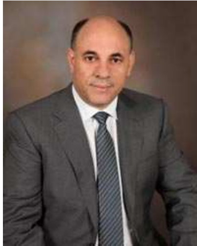
The Mayor of Latsia Mr. Panayiotis Kyprianou