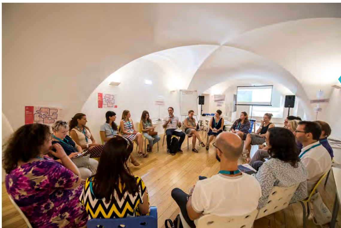
An URBACT lab, held during the City Festival

The final City Lab session is scheduled to take place in Germany in the spring of 2020. It will draw together the key points from the series, setting out recommendations to feed into the renewed Leipzig Charter. There are also plans to hold a special session linked to this work at the EUROCITIES Annual Conference taking place in Leipzig in autumn 2020.