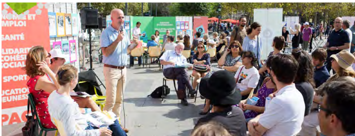
Active citizen participation during a Participatory Budget meeting in Paris, an URBACT Good Practice

Both the Paris and Cascais Participatory Budgets models are labelled as URBACT Good Practices.