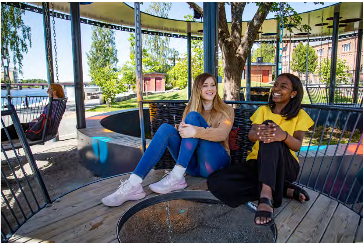
An example of the gender landscape in Umeå