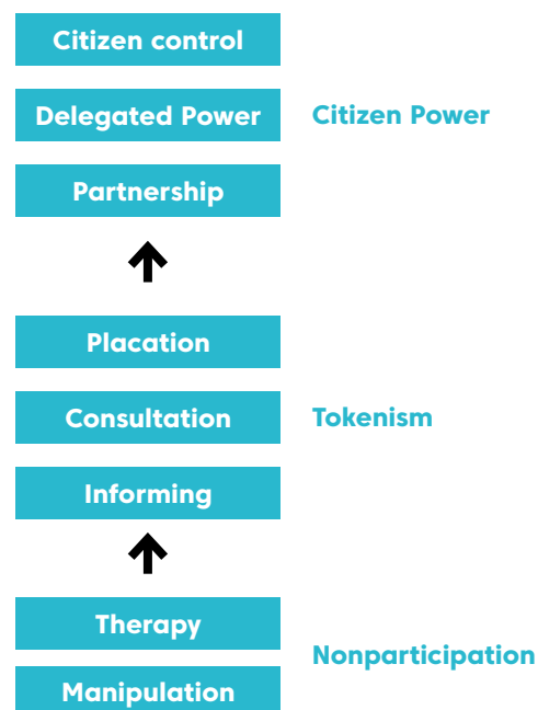
Figure 1: Sherry Arnstein's ladder of participation

The Model Cities programme called for 'maximum feasible participation'. Arnstein was an experienced policy maker who had served in the federal department for Housing and Urban Development and had seen tokenism in action on numerous advisory committees.