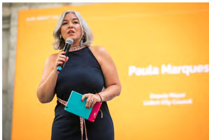
Lisbon's Deputy Mayor, Paula Marques, at the 2018 URBACT City Festival

what works and what cities can build upon. This paper also shines a light on the barriers to participation, exploring the factors that continue to obstruct and prevent participative approaches. The final chapter sets out the reflections on how to promote higher levels of active citizen participation in Europe's cities.