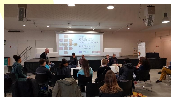
A working session of the Final Conference in Barcelona

the 1980s, an increasing volatility of employment and a huge recent increase immigration to Europe and its cities. These factors are complemented by a progressively retreating welfare state and privatisation of services in several countries leading to higher costs for basic needs.