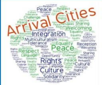
Managing global flows at local level